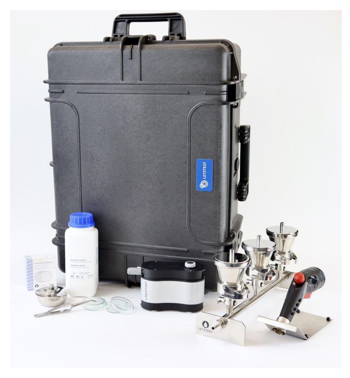
Figure 1 – The LETZTEST Laboratory Membrane Filtration Kit is a complete microbiological water laboratory for your remote and cost-efficient water lab with larger sample volumes per day.

A complete and professional microbiological water laboratory, designed for high-capacity sample processing to quantify E. coli and other fecal indicator bacteria per 100 ml in water samples, compliant with DIN EN ISO 9308-1 standard. This kit is ideal for central and remote water laboratories with large sample volumes per day, offering portability for setting up efficient project laboratories in remote areas. It can continue operating in the event of a power failure, and it allows for exceptionally low running costs with end-user flexibility for consumables. For your independence and optimal results, pair it with the <u>LETZTEST Big Electricity-Free Incubator</u>.