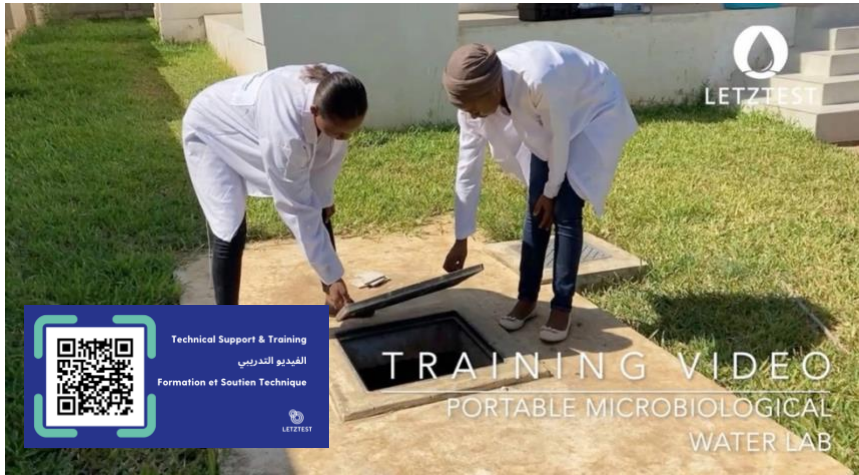
Figure 3 – A QR code in each kit leads you to a training video

Each kit contains a QR code that leads to a practical training video . In case of further questions, with the same code, the end user can directly and easily contact a LETZTEST technician.