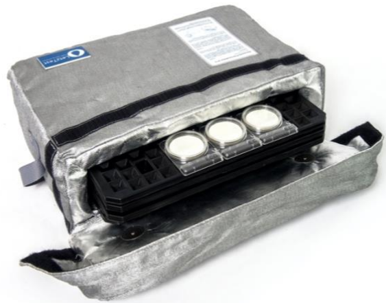
Figure 1 – Microbiological water analysis in remote places is easy and independent with the non-electric incubator from LETZTEST.